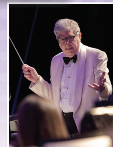
Marvin Hamlisch PRINCIPAL POPS CONDUCTOR

Summer Concert Series 2012 at The Arboretum